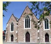
St. Patrick's 58 Morgan St Fortitude Valley