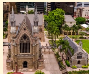
Cathedral of St. Stephen 249 Elizabeth St Brisbane