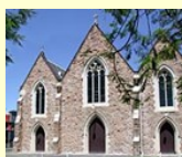
St. Patrick's 58 Morgan St Fortitude Valley