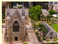
Cathedral of St. Stephen 249 Elizabeth St Brisbane