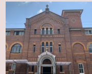
Villa Maria Chapel 171 St Pauls Tce Spring Hill