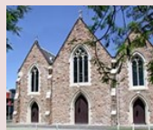
St. Patrick's 58 Morgan St Fortitude Valley