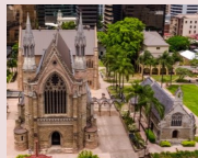
Cathedral of St. Stephen 249 Elizabeth St Brisbane