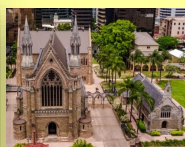
Cathedral of St. Stephen 249 Elizabeth St Brisbane

When they saw that the star had stopped, they were overwhelmed with joy. On entering the house, they saw the child with Mary his mother; and they knelt down and paid him homage.