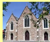
St. Patrick's 58 Morgan St Fortitude Valley