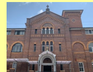
Villa Maria Chapel 171 St Pauls Tce Spring Hill No public Masses until further notice.