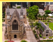
Cathedral of St. Stephen 249 Elizabeth St Brisbane