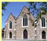
St. Patrick's 58 Morgan St Fortitude Valley