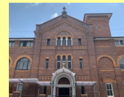
Villa Maria Age Care Chapel 171 St Pauls Tce Spring Hill No public Masses until further notice.