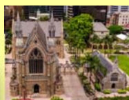
Cathedral of St. Stephen 249 Elizabeth St Brisbane

Likewise the pilgrim Church proclaims the passover of Christ in the feasts of the holy Mother of God, in the feasts of the Apostles and Saints, and in the commemoration of the faithful departed. To Jesus Christ, who was, who is, and who is to come, Lord of time and history, be endless praise, for ever and ever. Amen.