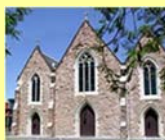
St. Patrick's 58 Morgan St Fortitude Valley