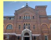
Villa Maria Age Care Chapel 171 St Pauls Tce Spring Hill No public Masses until further notice.