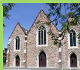
St. Patrick's 58 Morgan St Fortitude Valley