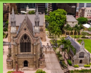
Cathedral of St. Stephen 249 Elizabeth St Brisbane