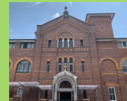
Villa Maria Aged Care Chapel 171 St Pauls Tce Spring Hill No public Masses until further notice.