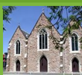
St. Patrick's 58 Morgan St Fortitude Valley