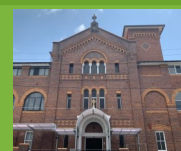
Villa Maria Age Care Chapel 171 St Pauls Tce Spring Hill No public Masses until further notice.