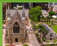
Cathedral of St. Stephen 249 Elizabeth St Brisbane