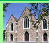
St. Patrick's 58 Morgan St Fortitude Valley