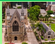
Cathedral of St. Stephen 249 Elizabeth St Brisbane

To listen to sacred Scripture and then to practice mercy: this is the great challenge before us in life. God’s word has the power to open our eyes and to enable us to renounce a stifling and barren individualism and instead to embark on a new path of sharing and solidarity. May we all become living words of God.