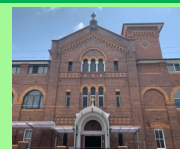
Villa Maria Age Care Chapel 171 St Pauls Tce Spring Hill No public Masses until further notice.