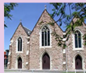
St. Patrick's 58 Morgan St Fortitude Valley