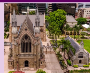
Cathedral of St. Stephen 249 Elizabeth St Brisbane