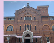
Villa Maria Age Care Chapel 171 St Pauls Tce Spring Hill No public Masses until further notice.