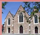
St. Patrick's 58 Morgan St Fortitude Valley