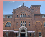
Villa Maria Age Care Chapel 171 St Pauls Tce Spring Hill No public Masses until further notice.