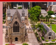
Cathedral of St. Stephen 249 Elizabeth St Brisbane