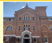
Villa Maria Age Care Chapel 171 St Pauls Tce Spring Hill No public Masses until further notice.