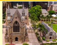
Cathedral of St. Stephen 249 Elizabeth St Brisbane

Christ's resurrection is not an event of the past; it contains a vital power which has permeated this world. Where all seems to be dead, signs of the resurrection suddenly spring up. It is an irresistible force. Often it seems that God does not exist: all around us we see persistent injustice, evil, indifference and cruelty. But it is also true that in the midst of darkness something new always springs to life and sooner or later produces fruit. Each day in our world beauty is born anew; it rises transformed through the storms of history, and human beings have arisen time after time from situations that seemed doomed ( Evangelii Gaudium , 276).