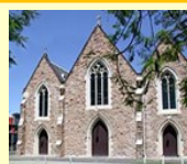
St. Patrick's 58 Morgan St Fortitude Valley