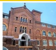
Villa Maria Age Care Chapel 171 St Paul's Tce Spring Hill