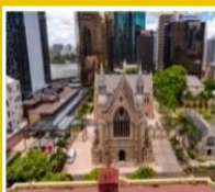
Cathedral of St. Stephen 249 Elizabeth St Brisbane City