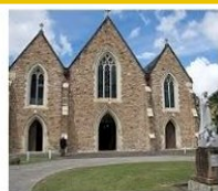
St Patrick's 58 Morgan St Fortitude Valley