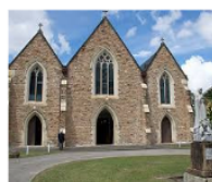
St Patrick's 58 Morgan St Fortitude Valley