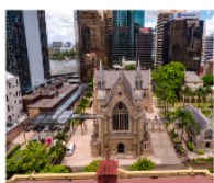
Cathedral of St. Stephen 249 Elizabeth St Brisbane City