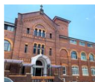
Villa Maria Age Care Chapel 171 St Paul's Tce Spring Hill