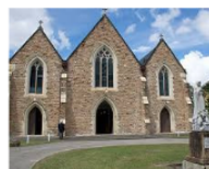
St Patrick's 58 Morgan St Fortitude Valley