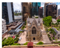
Cathedral of St. Stephen 249 Elizabeth St Brisbane City