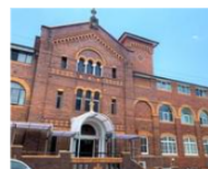
Villa Maria Age Care Chapel 171 St Paul's Tce Spring Hill