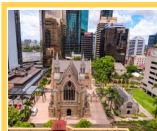
Cathedral of St Stephen 249 Elizabeth Street Brisbane City