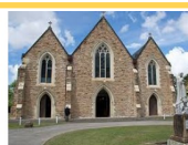
St Patrick's Church 58 Morgan Street Fortitude Valley