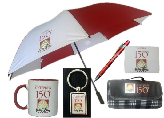
Pens; Keyring; Mousepad; Coasters; Coffee Mug; Picnic Blanket; Umbrella

Extraordinary Ministers of Holy Communion A special ritual will be held to recognise, commission and re-commission all members of our parish who are Extraordinary Ministers of the Holy Communion. This will happen at all Masses on the weekend of 3 rd /4 th February, the Fifth Sunday in Ordinary Time. If you serve as an Extraordinary Minister, please ensure that you are able to attend one of these Masses for this special commissioning and recommissioning ritual. If you are not an EMHC but would like to join this ministry, please contact the Cathedral Office to find out how to go about the training.