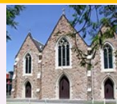
St. Patrick's 58 Morgan St Fortitude Valley