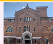
Villa Maria Chapel 171 St Pauls Tce Spring Hill