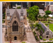
Cathedral of St. Stephen 249 Elizabeth St Brisbane