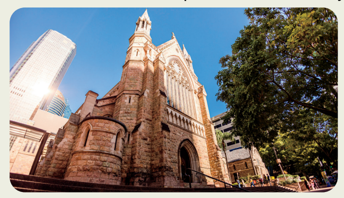
The Chapel of St Stephen - Brisbane City; or

The Cathedral of St Stephen - Brisbane City;